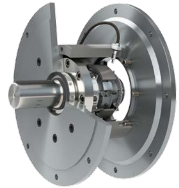
EAS ® -reverse in housing with standard-conform dimensions