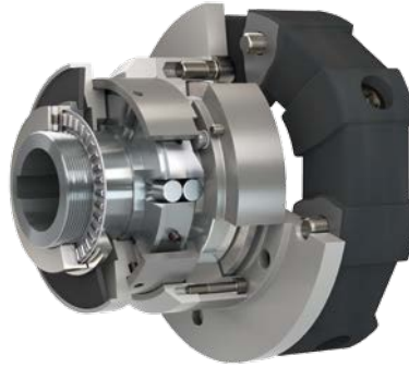
EAS ® -reverse double shaft design with a flexible, positive locking coupling