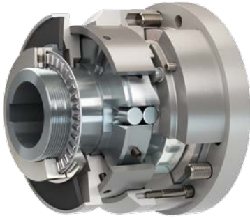
EAS ® -reverse with bearing-supported flange for direct mounting of drive elements